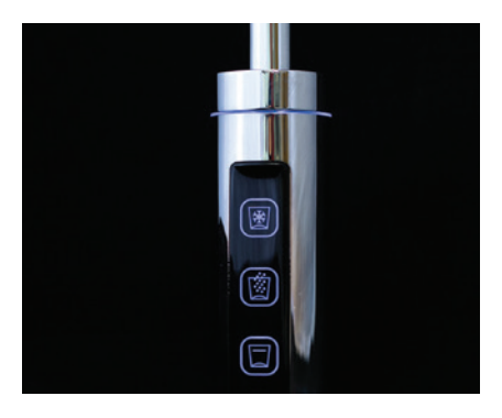
Smart LED Touch Pad

When the tap is active, the LED ring around the tap will be blue. Touch it once and it changes to green and is ready to dispense. The LED touch pad will also alert you if the system has detected a fault. It will flash the LED lights and sounding an audible alarm from the under sink